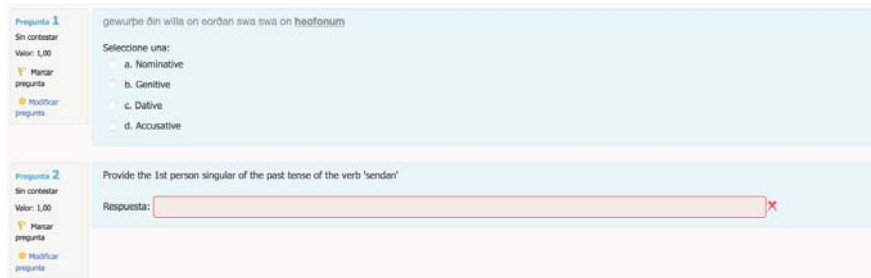
Figure 3. Self-assessment.

The self-assessment process finishes with a test which the students are asked to fill in in class. The test has been designed to contain multiple-choice, true/false and open answers, making up a total of 20 questions which review different aspects of the course contents: from simple questions about the morphology of the different word classes to the morphological analysis of words in context. The questions are given in jumbled order to the students to avoid cheating from the other classmates’ screens. A minimum of fifteen questions must be answered correctly in order to pass the unit with some level of proficiency. If not, the students will have to revise the course material and fill in a new test in the next face-to-face session. A successful performance here is taken as a requisite before they begin with the second unit, concerned with the transition from Old to Middle English. Figure 3 reproduces the type of questions in this self-assessment; the first one is a multiple-choice question and the second one asks for an open answer.