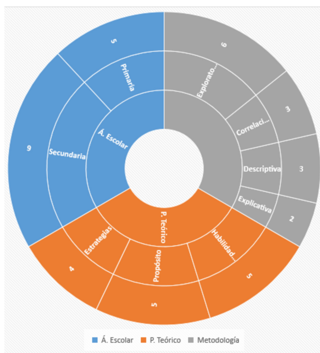
Graph 2. Organisation of the 14 publications consulted

On its part, graph 1 shows the 85 documents collected during the first phase, 14 of which met the criteria of the second phase by classifying the research by age range, by its theoretical and its methodological approach. Nevertheless, the remaining 71 publications focus on a higher age group as in the following cases involving university students and adults (Gabay & Holt, 2015; Müller, 2012). In addition, those publications that refer to video games without mentioning the hypothesis exclusively were not included from the theoretical approach, including television or other media in the results (Romer, Bagdasarov & More, 2013), or those that refer to reading as another literacy component without exploring the development of its variables (Beavis, 2014;