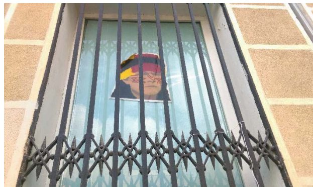
Illustration 6. Wheat Paste Poster in El Rastro, Madrid.