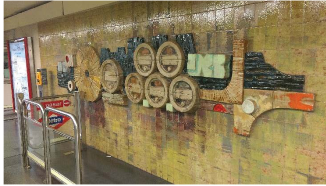
Illustration 7. Street Installation in Malasana metro station, Madrid.