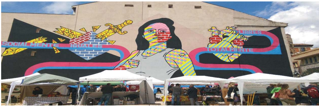
Illustration 9. Legal walls in El Rastro, Madrid.

paint the house walls or shop doors (Illustration 9). Since legal wall artists don't have constraints on time or security, a completed legal wall becomes a high-quality art piece with much time invested in it (Allen, 2013).