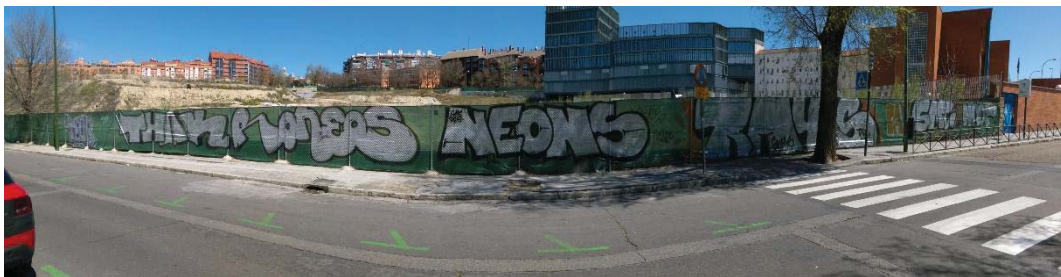
Illustration 3. Tagging in Ventas, Madrid.