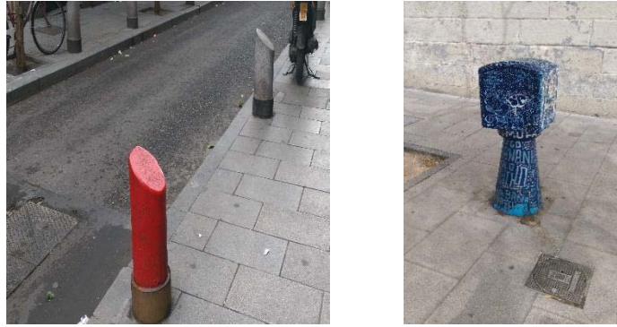
Illustration 4 & 5. Yarn bombing in El Rastro and Embajadores, Madrid.