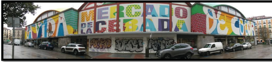
Illustration 1. Legal UA murals, Cebada market, Madrid.