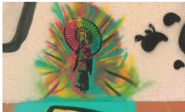
Illustration 8. Stencil graffiti in El Rastro, Madrid.