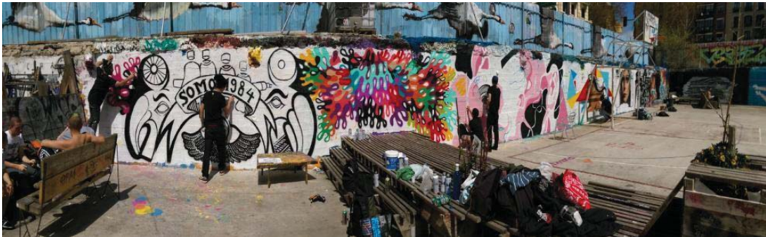
Illustration 2. Legal urban artists painting in La Latina community centre, Madrid.

The fact that UA is attracting tourists, yet receives less support from the government, brings to light an important question. Is it possible to use the UA scene in these cities as a tourism development tool, in cooperation with the government? If so, what benefits will there be to tourism and how can these benefits be reaped? Thus, considering the city of Madrid as a case study for UA, this research investigates whether or not UA can be used in attracting tourists in Madrid, and how UA can be further developed.