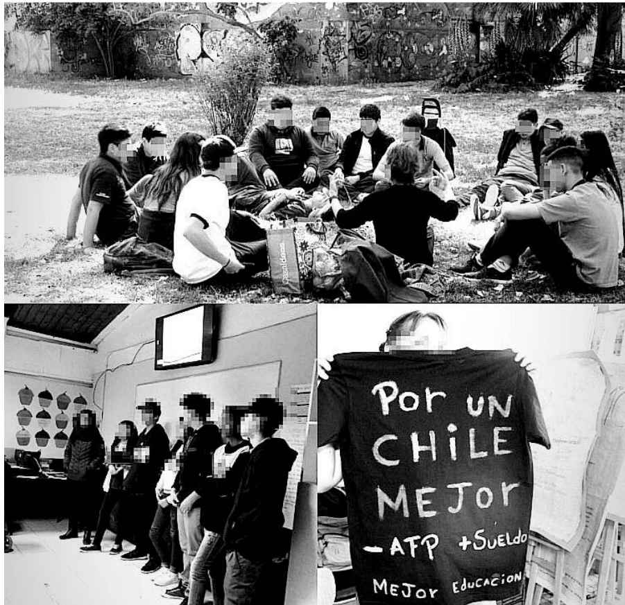
Figure 2. Students working in one of the schools and in a nearby park.

Concerning the transformative practices, this project focused on poverty and social inclusion of the neighborhoods where the two involved schools were located. In the initial sessions of the project, the students discussed which differentiating and common aspects existed within the students that composed the group. The first topic proposed by the students was racism and xenophobia at school. Foreign students (mostly Haitians) expressed their discomfort with receiving offensive and xenophobic comments during