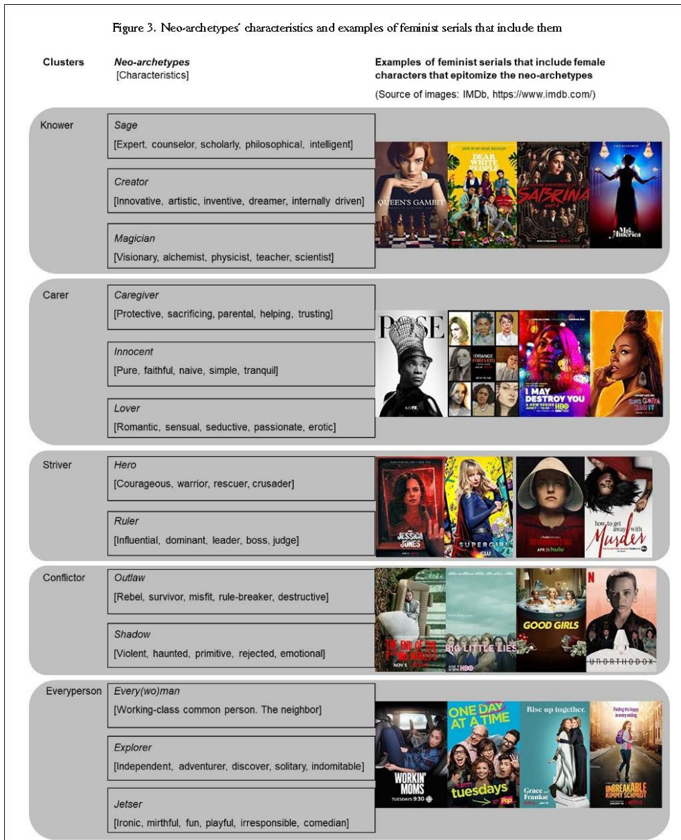
Figure 3. Neo-archetypes' characteristics and examples of feminist series that include them

Firstly, series broadcasted on Netflix and HBO between 2017-2020 with a gender perspective were identified. Secondly, we selected those with feminist storylines and female presence. Thirdly, the socio-demographic profile and the behavior of the main female characters of these feminist series were analyzed using an intersectional feminist approach. Finally, researchers consensually selected the characters that epitomized the neo-archetypes and can be highlighted as good practices of female representation. Therefore, this study combines quantitative analysis for describing on-screen/off-screen female presence with qualitative content analysis.