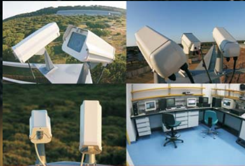
Figure 2. Images of the control room and some of the high sensitivity CCD video cameras of the CIECEM meteor observing station.

Since November 2008, a new robotic observatory is being setup by the University of Huelva within the environment of the Doñana Natural Park, in the south-west of Spain. Most of the systems in this astronomical observatory operate within the framework of the Spanish Meteor Network (SPMN), which is an interdisciplinary project dedicated to study meteoroids streams and the interaction of these particles of interplanetary matter with the Earth's atmosphere. For this we employ a system consisting of an array of high-sensitivity CCD video cameras for automatic meteor detection. Besides, an automated system for lunar impact flashes detection is being setup in collaboration with IAA-CSIC. This is based on three robotic telescopes that monitor the impact of meteoroids on the surface of the Moon. An important synergy is expected from the results recorded by both systems. Besides, climate conditions in this area provide us about 320 useful nights per year for astronomical observation, which makes this location ideal for this research project.