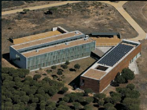
Figure 1. Aerial view of the research center (CIECEM) where the robotic observatory is been installed. Bottom: distribution of domes containing the telescopes for moon impact flashes detection.

The MIDAS software has been recently developed to identify lunar impact flashes produced by meteoroids. It allows for fast real time processing of the images obtained by the CCD video cameras attached to the telescopes. These are continuously analyzed to identify the flashes and calculate the corresponding selenographic coordinates of the impact and which is the likely origin (meteoroid shower and radiant) of the meteoroid. A photometric analysis is also performed in order to obtain the mass of the impactor. When a telescope detects an event, it communicates with the other telescopes in the system via TCP/IP network protocol (up to 256 telescopes could be connected in this way). The other telescopes may then confirm or not the detected event. If the event is confirmed, it is automatically stored in a database. On the contrary, the event is ignored.