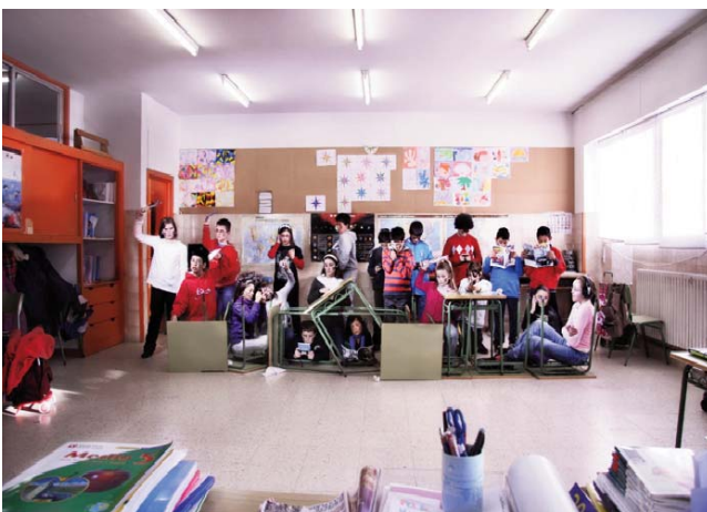
Figure 1. Photographs by contemporary artist Jesús Madriñán, students of the Faculty of Education and students of CEIP "Emilia Pardo Bazán" Primary School.