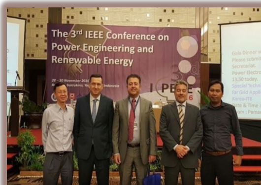
Aurora presentation in ICPERE-Indonesia.