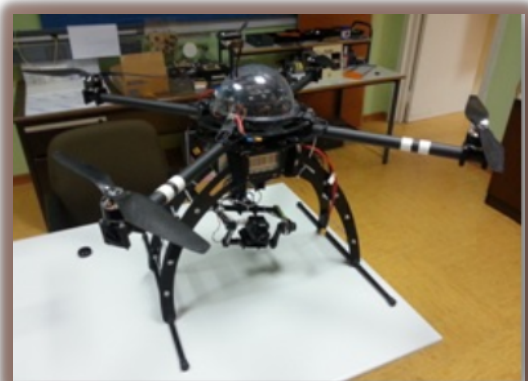
Tecnolivo: detail of a drone to be used in the project.

'Tecnolivo' aims to contribute to the technological development in the olive sector in the province of Huelva, promoting the transfer of technology from the university, so that greater business opportunities and quality of employment can be generated.