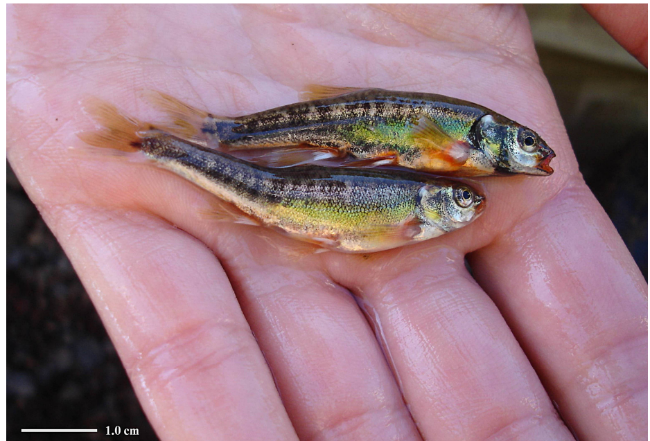
Figure 2. Minnow ( Phoxinus spp.) specimens captured in the Guadalquivir basin (only two are shown) during the field session with emerging spawning characteristics: bright colours, reddish base of fins, darker band on the flanks, and yellow spots on the operculum.