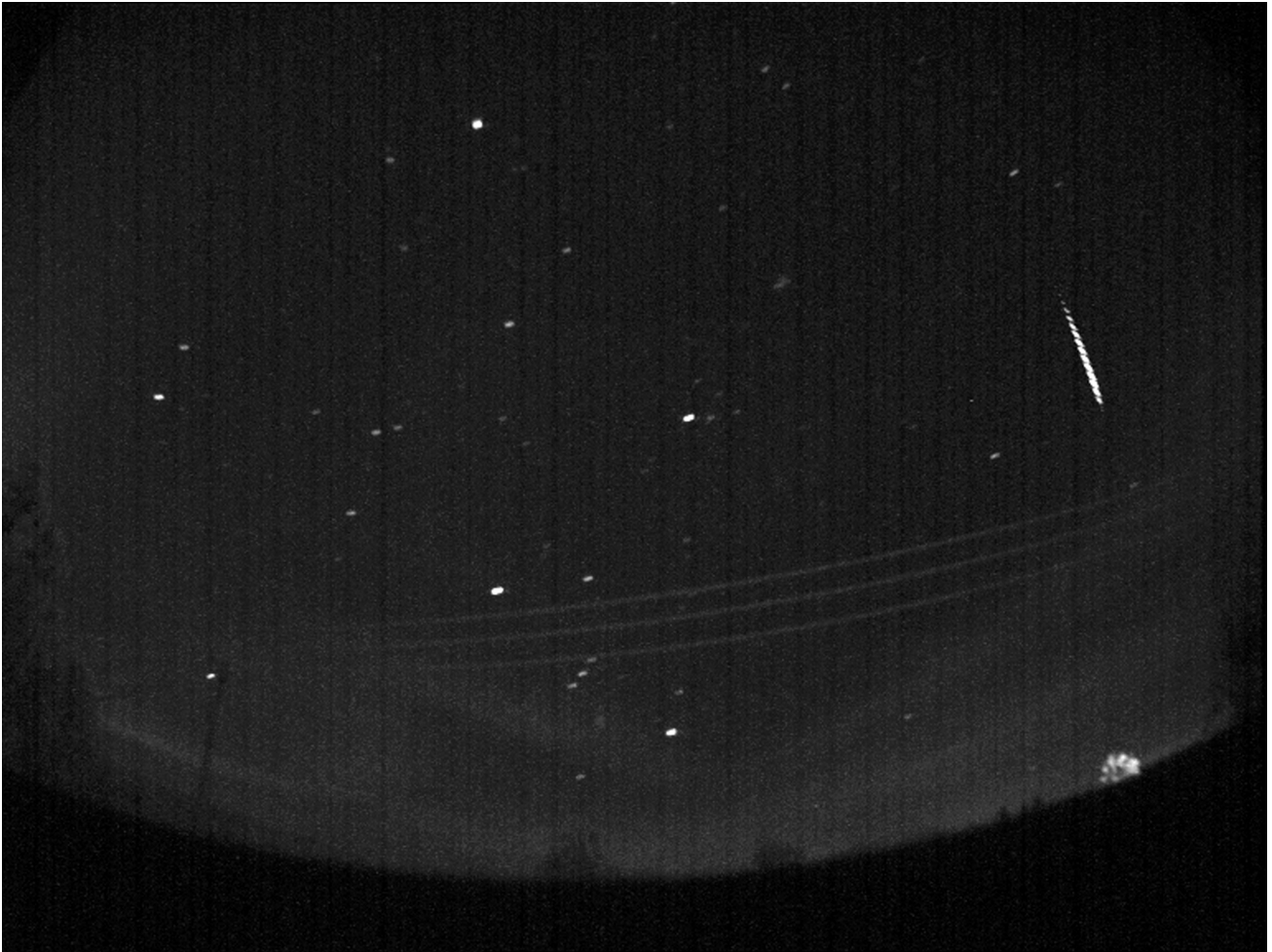
Figure 1. Composite image of the FN200110 GUM meteor, imaged on 2010 January 20 at 17^{\text{h}} 17^{\text{m}} 57 \pm 2\text{s} UTC from Piekämäki (Finland).

stream because the smaller particles are missing among the members crossing Earth's orbit. The brightest multi-station meteors registered during this observing campaign were imaged from Finland. The first of them (Fig. 1), with a magnitude of -3.0 \pm 0.5 , was simultaneously recorded from stations 9, 11 and 12 in Table 1 on January 20, at 17^{\text{h}} 17^{\text{m}} 57 \pm 2\text{s} UTC (code FN200110). The second of these meteors, which is shown in Fig. 2 and had a magnitude of -3.5 \pm 0.5 , was imaged on January 21, at 21^{\text{h}} 46^{\text{m}} 21 \pm 2\text{s} UTC, from stations 10 and 12 (code FN210110). From Spain, two additional double-station trails with magnitudes +1.0 \pm 0.5 and 0.0 \pm 0.5 , respectively, were recorded on 2010 January 20 from stations 1 and 3.