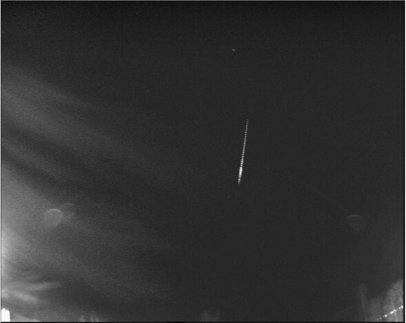
Figure 2. Composite image of the FN200110 GUM meteor, imaged on 2010 January 21 at 21^{\text{h}} 46^{\text{m}} 21 \pm 2\text{s} UTC from Joutsa (Finland).

parameter with respect to Jupiter T_J = 2.55 is obtained. This suggests that GUM meteoroids are associated with a Jupiter family comet.