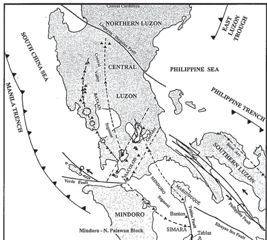
Fig. 1. - Mapa de situación de la isla de Simara y mapa tectónico simplificado de la parte meridional de Luzon (islas Filipinas). Los triángulos representan centros volcánicos.

Fig. 1.- Location map of Simara island and simplified tectonic map of southern Luzon, Philippines. Triangles represent volcanic centers.